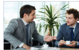
Technology appraisal and selection

With so many manufacturers, models and technical features having a technology partner that can provide free impartial advice will take the complexity and risk out of your projects. Working independently with leading brands such as Zebra® and Honeywell®, we can manage any size project providing expert advice on selection, integration and on-going support to your business operations.