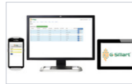
Provisioning, Integration and installation