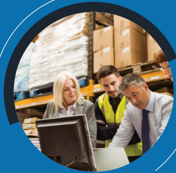
OXKEM CHEMICALS, OXFORD

"Along with easy to use multi-location stock control G-SMart Stock has given us excellent batch traceability of materials across our production and supply processes. The system has easily fitted in with our internal processes benefiting all departments."