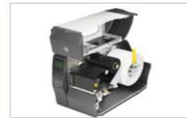
Support and maintenance services

The range of barcode hardware is vast and the choice of features complex. GSM Barcoding's team of experts will help you choose the right hardware technology for your particular sector and application requirements. Choose the right technology first time.