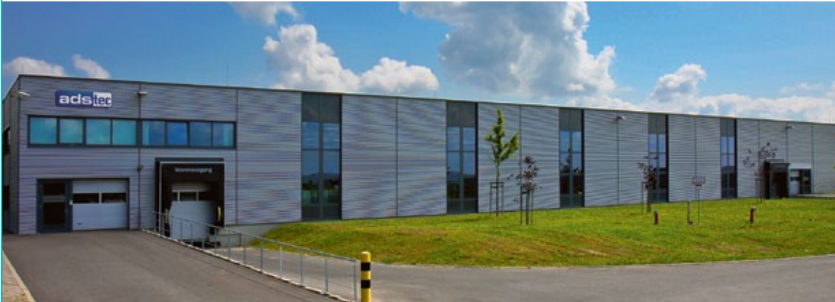
Company headquarters (above) in Nürtingen near Stuttgart, production site in Wilsdruff near Dresden