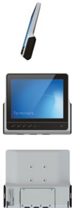
Terminal VMT9000 Series